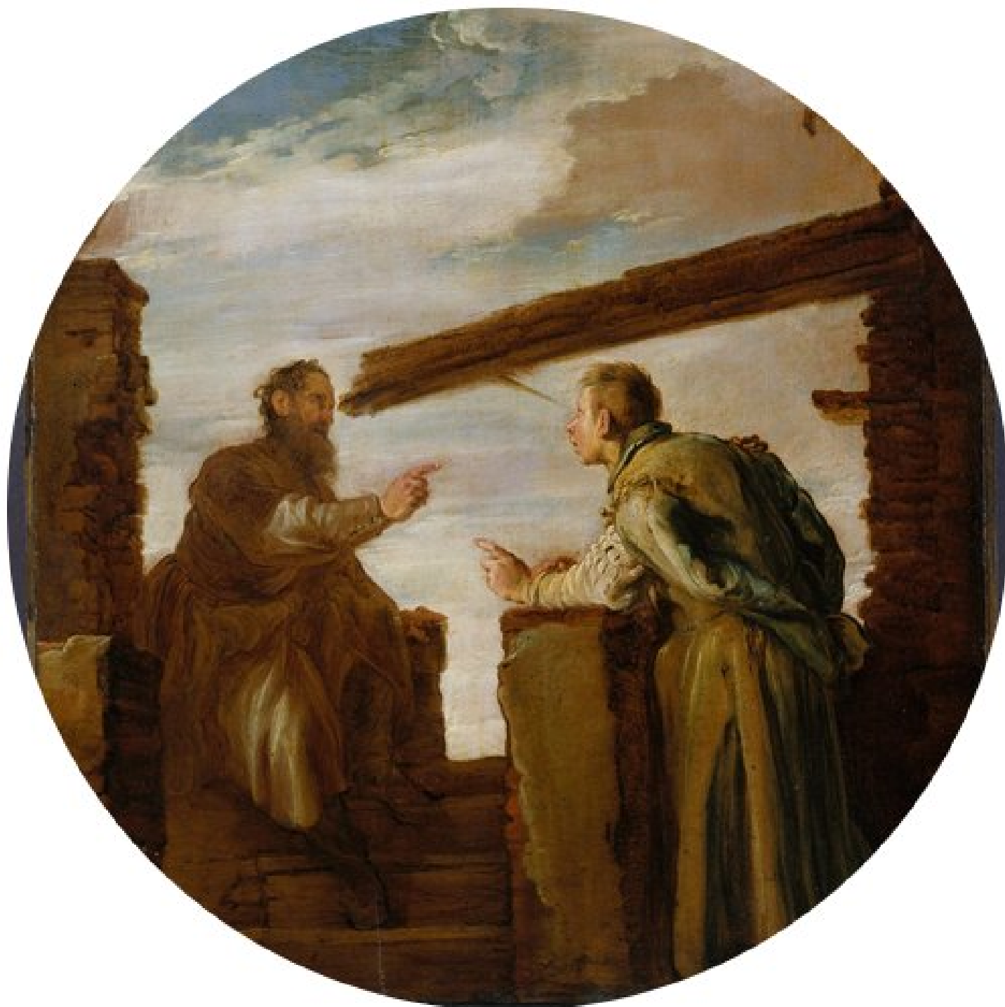
Domenico Fetti (1589-1623) Η σκλήθρα και η σανίδα (c1619)