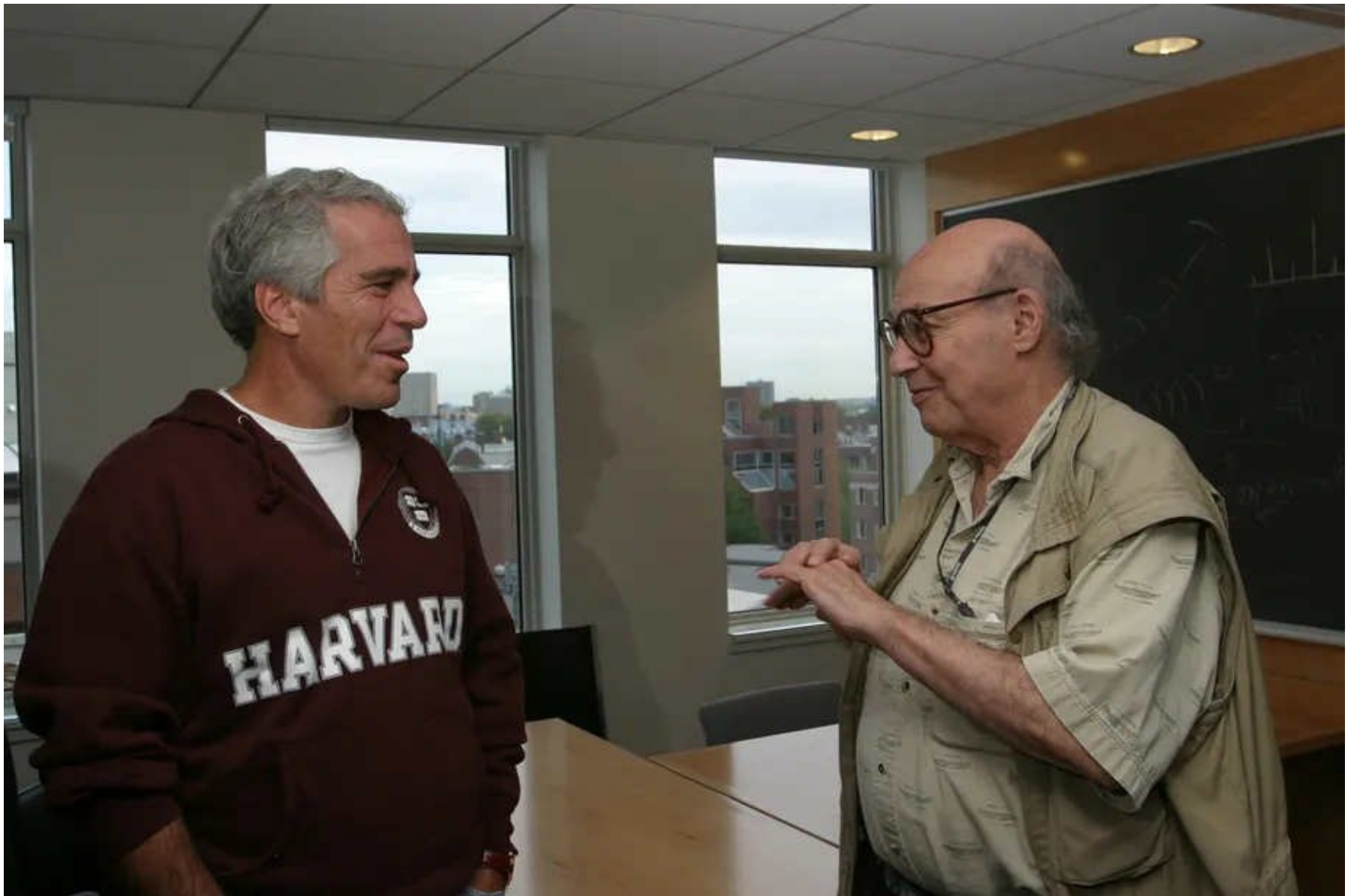
Marvin Minsky (1927–2016)