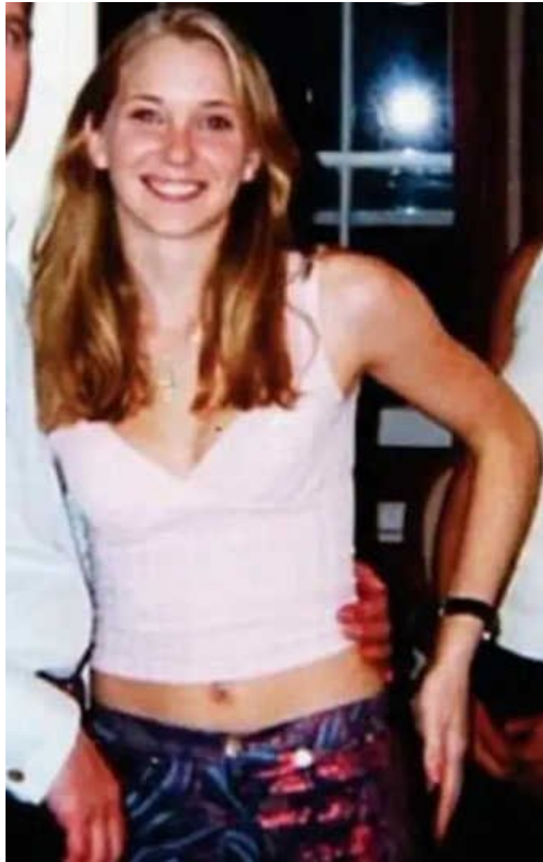
Virginia Roberts Giuffre (b. 1983)