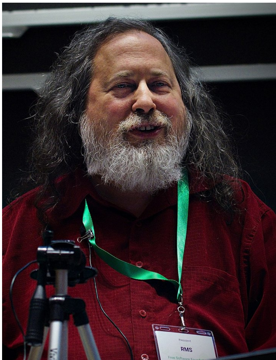
Richard Stallman (b. 1953)